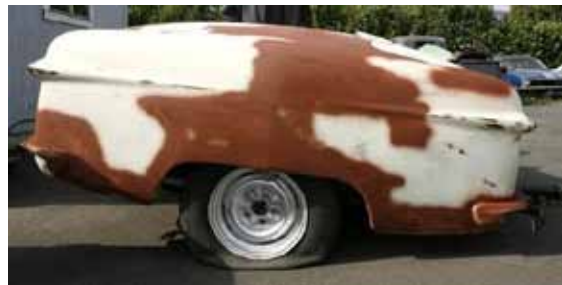
Looks like two Ford rear sections joined together to make a trailer ?

STEVENSON, Skamania County — The only guarantee from Sam's Used Cars in downtown Stevenson is that every car is "used, well-used. That's a guarantee."