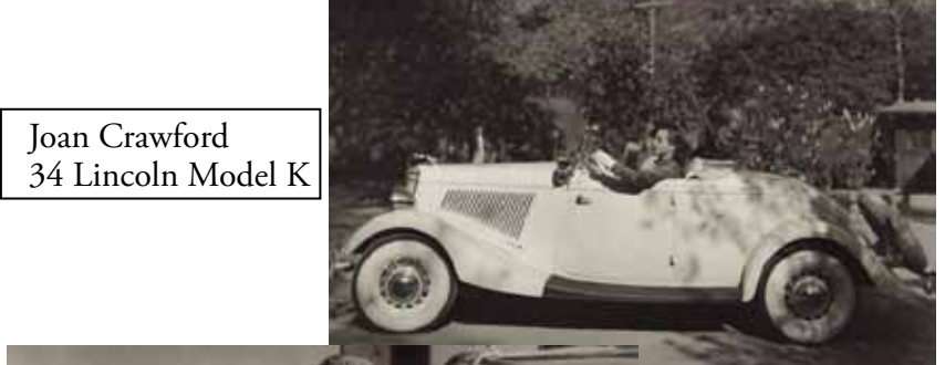
Joan Crawford 34 Lincoln Model K