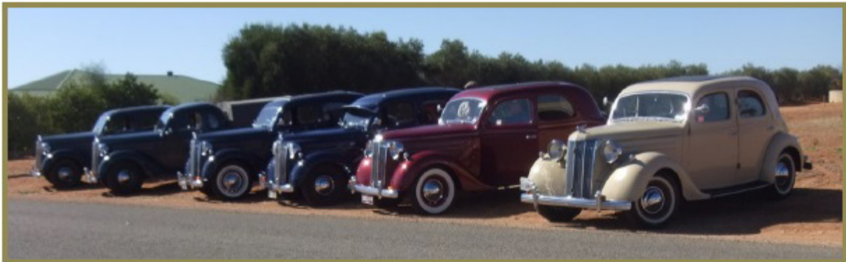
The Pilots lined up at the 16 th National Meet, Renmark, South Australia - 2018.

Now that I am retired, I have more time to work on the car and keep it running.