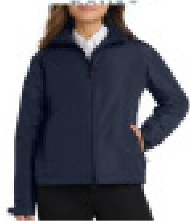
NAVY or ROYAL