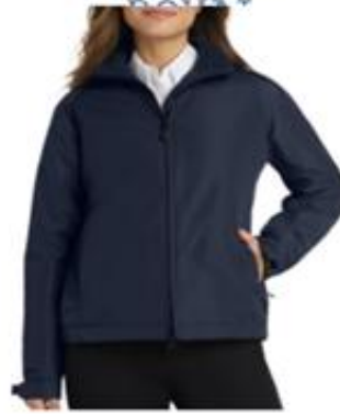
NAVY or ROYAL